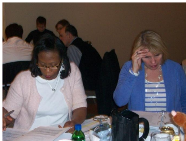
Rapt attention from participants at Boot Camp #4, Chicago IL.